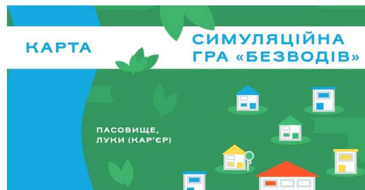
Will the players be able to form majority and come up to a common solution?

There is a town in Lyandia that has a huge problem of no proper access to water. The name of this town, Nowaterburg, reflects this issue. The source of water is far from the town, and as parents have to work to provide for their families, the task to bring water is a burden of their children. It takes a lot of their time, so children often miss school and cannot study well. Moreover, they do the household work, as their parents anyway do not see a lot of perspectives for their children after graduating from school. Diseases caused by bad water are spreading across population. Recently, an investor came to the town willing to take over the pasture land. Some locals are against it but some see in the investment also an opportunity to solve the water problem. How to supply the town with water and protect the right to education? How to achieve an agreement about possible investments?