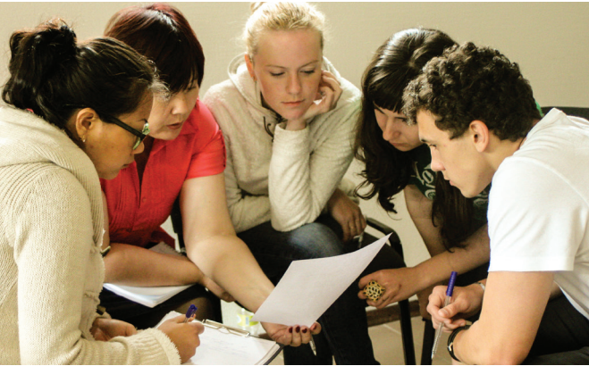
Participants in discussions about the effectiveness of different tools to fight right-wing populism.

Right-wing populism, Minority Issues, Democratic principles